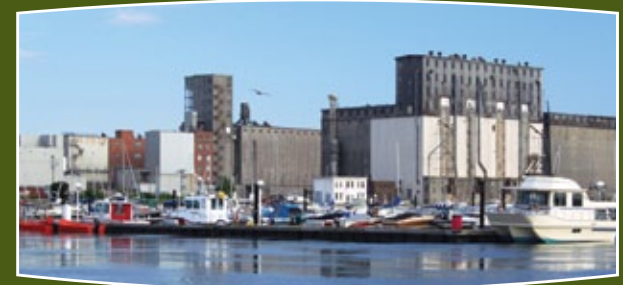
ADM Milling and Goderich Elevators

Jungbunzlauer and Casco have already established a strategic alliance and others in the biotechnology industry are looking for new ways to become part of this cluster of dynamic companies.